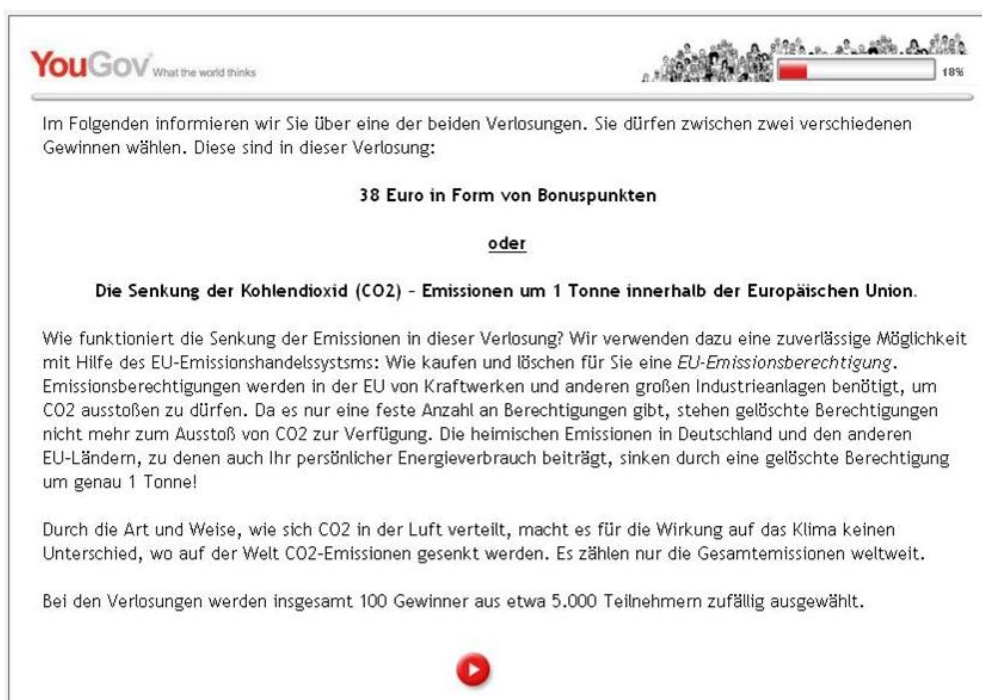
Figure 1: Information screen of the EU treatment

Notes: Highlighted in bold are differences in phrasing to the EU treatment.