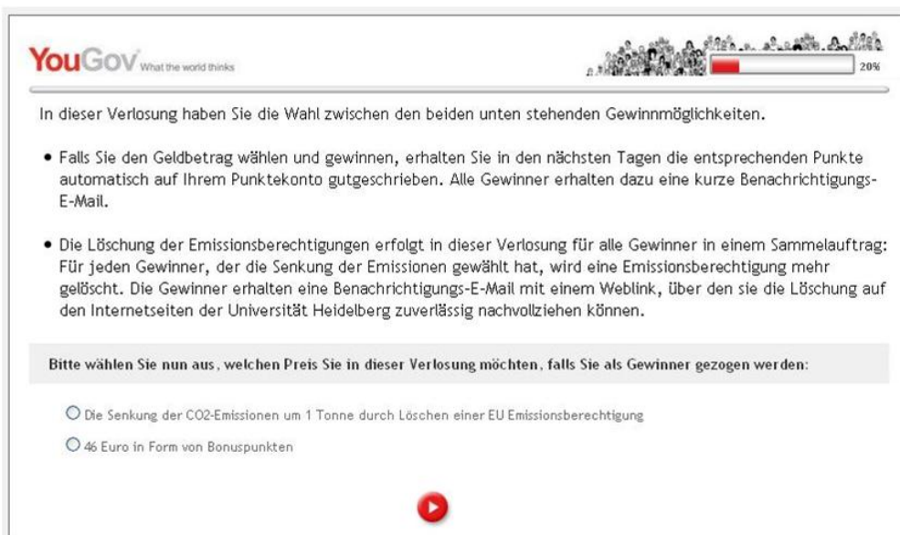
Figure 6: Decision screen , NE treatment