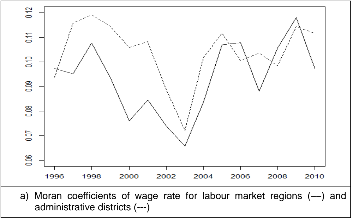
Figure 1: Moran coefficients of the wage and the unemployment rate

For testing nonstationarity properties in spatial panel data, cross-sectional dependencies have to be taken into account. Spatial autocorrelation of georeferenced variables can be assessed with the Moran test (Anselin 1988, pp. 101). Here we focus on spatial autocorrelation of the key variables, namely wages and unemployment. Figure 1 reveals striking differences in the strength of spatial dependence between both variables.