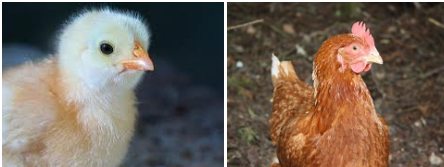
FIGURE 3.—Pictures of a chick and a grown hen.

In this study, a laying hen is entrusted to your care. It is a young and healthy hen. The hen is now old enough (18 weeks) to be put into a coop with other laying hens on a Franconian farm. In this regard, there are two options for the laying hen among which you may choose. The hen will live for another approximately 13 months from the time it is put into the coop.