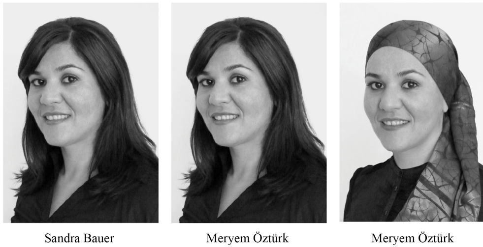
Fig. 1. Names and photographs, indicators for identity