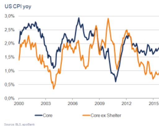
Figure 2. Core CPI inflation with and without shelter costs.

We can now put the pieces together. First, asset price inflation raises general inflation (core CPI inflation), pushing the economy closer to the 2 percent target and triggering the Fed to remove the punch bowl. Second, asset price inflation creates financial fragility, which may also trigger the Fed to remove the punch bowl. Third, because asset markets are speculative and forward looking, asset price inflation tends to show up early in the cycle. Consequently, because of its 2 percent inflation target and fear of financial excess, the Fed has reason to remove the punch bowl long before the economy is close to Main Street's bliss zone.