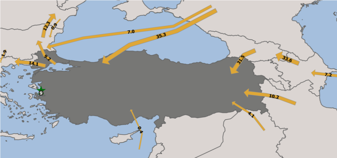
Figure 2. Estimated Gas Flows through Turkey in 2030 – Reference Scenario

The results of the reference scenario so far suggest that Turkey’s importance in European supply security will only slightly increase over the period under investigation. In 2030, for instance, Turkey would re-export 23.3 bcm of gas to Bulgaria and Greece, contributing only 4.8% of total European consumption, while her imports would rise to 90.5 bcm (Figure 2). Furthermore, according to the results these re-exported gas volumes would be originated mostly from Azerbaijan and Iran, while Russian gas will be consumed within the Turkish domestic market. In this section, we try to answer the question under which conditions Turkey’s role would increase and in doing so we consider different scenarios, which allow us to detect drivers for higher natural gas transits via Turkey.