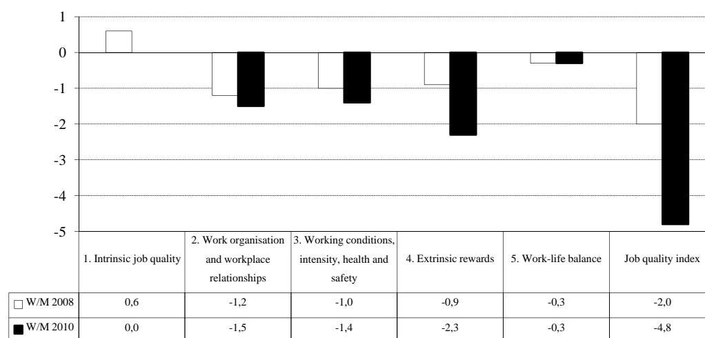
Figure 3. Gender inequality in job quality in Spain (means differences). 2008 and 2010

In short, and as can be seen in Figure 3 (which shows the differences between men and women of the mean values of the 5 explanatory dimensions and the aggregate composite indicator in 2008 and 2010), gender inequality in job quality increased during the recession in Spain. Although inequality already existed at the start of the crisis (2 points difference in the composite indicator of job quality in favour of men: M = 43.9 for women and M = 45.9 for men), this inequality increased during the recession and had more than doubled by 2010 (4.8 points difference in the composite indicator of job quality in favour of men: M = 51.3 for women and M = 56.1 for men). Of the explanatory dimensions of job quality, 4 of the 5 were responsible for this increase in gender inequality: intrinsic job quality (IJQ) (from 0.6 points difference in 2008 to 0.0 points difference in 2010), work organisation and workplace relationships (WOWR) (from -1.2 points difference in 2008 to -1.5 points difference in 2010), working conditions, work intensity and health and safety at work (WCWIHS) (from -1.0 points difference in 2008 to -1.4 points difference in 2010), extrinsic rewards (EXRW) (from -0.9 points difference in 2008 to -2.3 points difference in 2010). However, inequality in the work-life balance (WLB) dimension remained stable (-0.3 points difference in 2008 and -0.3 points difference in 2010).