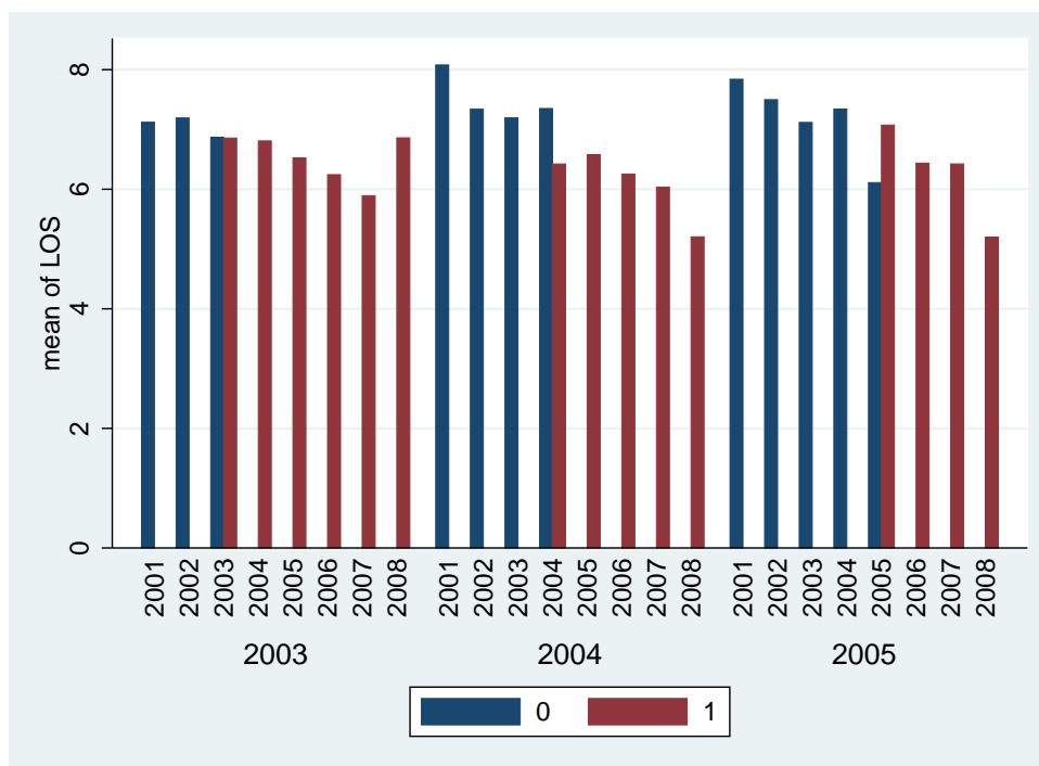
Figure 1: Mean LOS by system, year and timing of PPS adoption.

group of bars are hospitals that did so in 2005. While the patterns for LOS look similar across these groups, there seems to be some selection with regards to the readmission rate: Hospitals that seem to struggle with quality under FFS and anticipate to continue to do so after adopting PPS seem to delay the system change as long as possible. This is plausible as readmissions are costly under PPS but were fully reimbursed under FFS.