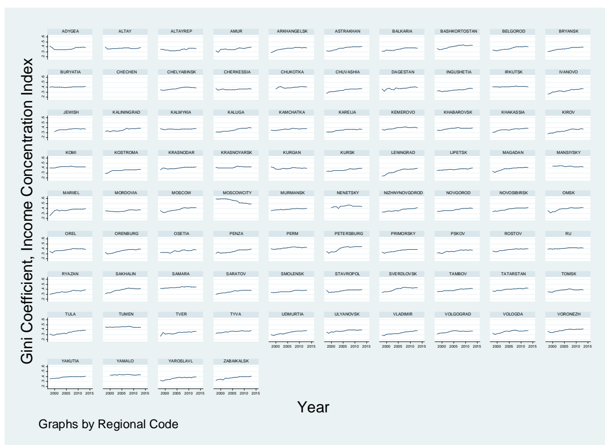
Figure 2: Gini Coefficients in Russian Regions, 1998-2015

Source: Rosstat, Bank of Finland, own computation.