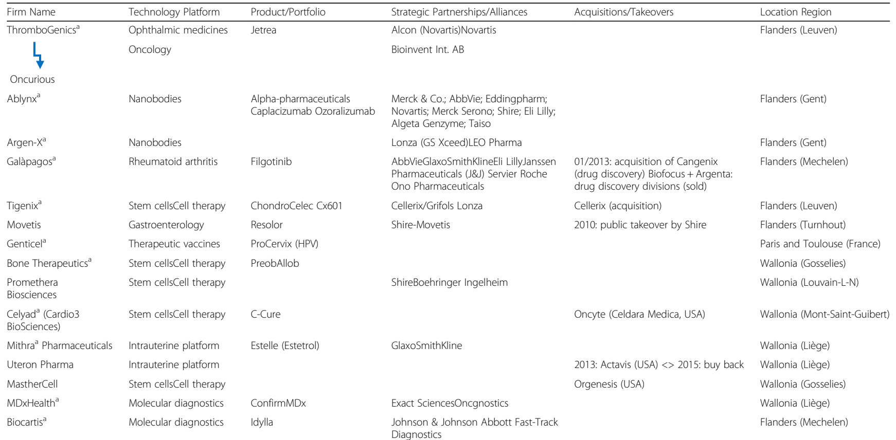
Table 1 Belgian New Biotechnology Firms (red biotech) & Strategic Partnership Alliances