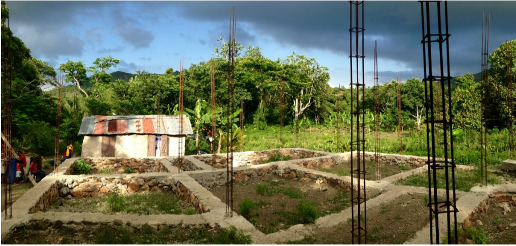
In the foreground is the foundation for the new home of a worker allowed to work in the US in 2015, under construction in 2016 for his family of seven. In the background, his current two-room home. Taken May 22, 2016 in Milot, Nord.

All ‘traveled’ households expressed plans to dedicate earnings from abroad to durable goods and investments. At the time of the survey, seven of the twelve households with a member who traveled had already begun this: two began home construction work (Figure 5), three bought durable goods, and four paid down outstanding debt for agricultural investments. Each household surveyed also reported using the funds remitted to support other family members in Haiti, though it was difficult to quantify the size of these transfers. As eight of the workers had already traveled again to the US for the 2016 farming season, many household members said they would wait for the household member to return to Haiti at the end of the year to undertake the bulk of investments. Eight households had plans to expand their home, three hoped to buy more livestock, and three planned to open or expand small household shops.