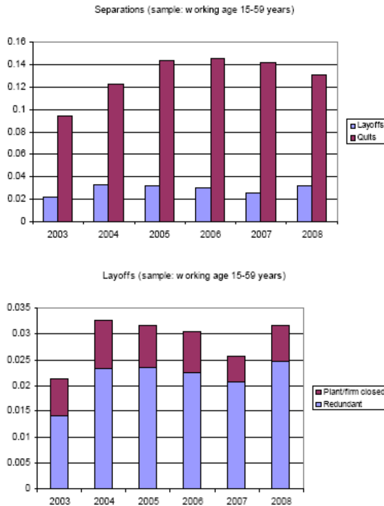
Figure 1: Separations and Layoffs

Source: Authors' calculations based on RLMS supplement on displacement.