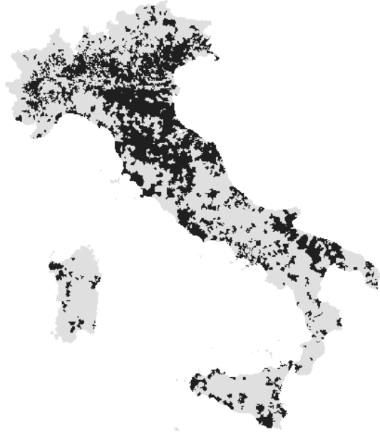
Figure 2. Municipalities hosting at least one firm (in dark)