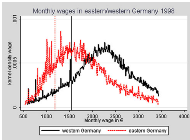
Fig. 1 Wage distributions in western and eastern Germany in 1998. Note: Vertical lines indicate low-wage thresholds. Wages are right censored at the contribution assessment ceiling