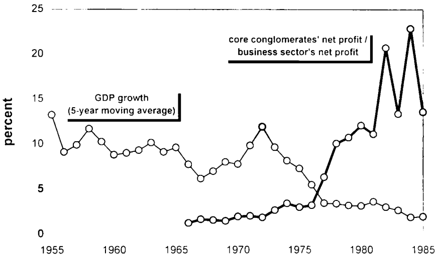
Figure 2 Macroeconomic Growth and Differential Accumulation