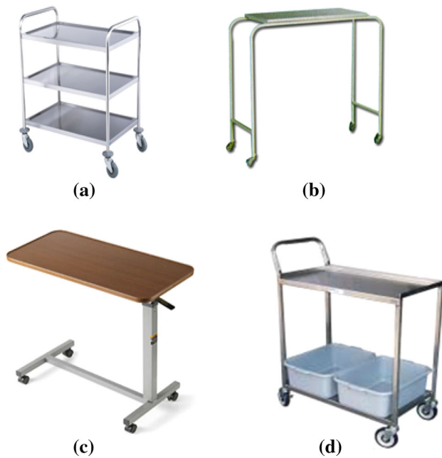
Fig. 1 Picture of some of the hospital meal carts common to Nigeria hospitals: a Three-layer hospital meal cart; b over bed table/meal cart; c over bed table/meal cart; d two-layer hospital meal cart

Statistics on pushing and pulling from Reporting of Injuries, Diseases and Dangerous Occurrences Regulations (RIDDOR) investigated by Health and Safety Executive (HSE) showed that the most frequently reported site of injury was the back (44 %), followed by the upper limbs (shoulder, arms, wrist and hand) accounting for 28.6 %, 12 % for accidents involving pulling than pushing, 61 % of accidents involving pushing and pulling objects that were not supported on wheels (bales, desks, etc.) and 35 % of pushing and pulling accidents involving objects (Health and Safety Executive 2013). Also Jung et al. (2005) revealed that the use of hospital meal carts was designed to ease the burden of manual material handling on workers, and it has been shown to be efficient because of less energy used per time. However, recent studies reported that these carts have caused suffering and injuries to workers and has increased the risk of musculoskeletal problems.