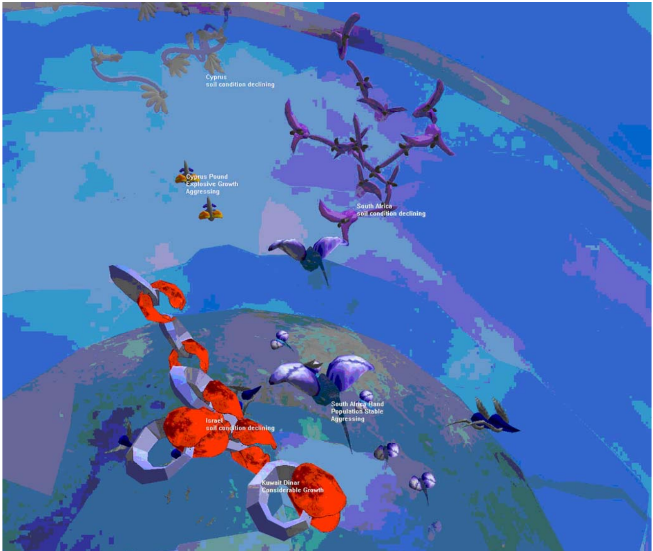
Figure 1 Ecosystem, by John Klima.

tion on it, The Making of Black Shoals . In this dvd, Autogena and Portway recount how their original piece was installed at the Tate Modern Gallery in 2002. Black Shoals constitutes a critique to the opaqueness of formulae such as Black-Scholes. The name of the installation, Black Shoals , combines that of the aforementioned Nobel Prize-winning formula with an allusion to dark shallow waters.