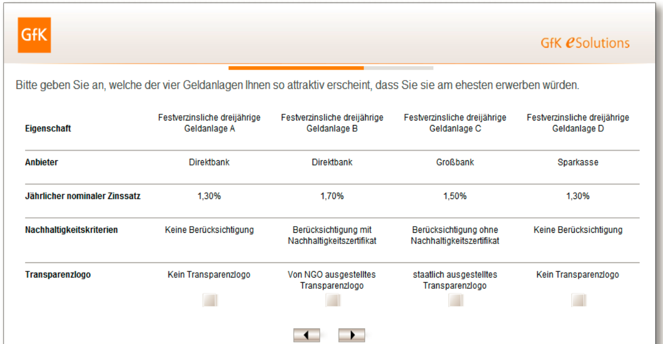
Figure 1: Original screenshot of an exemplary choice set for the first SC experiment on three-year fixed-interest investment products