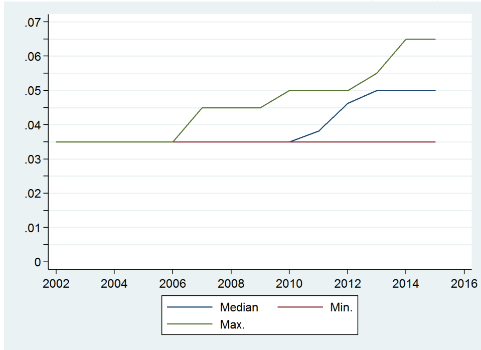
Figure 1: Real Estate Transfer Taxes in Germany (2002-2015)

Note: The figure shows location measures for the real estate transfer tax among the German states. The vertical axis measures the statutory tax rate.