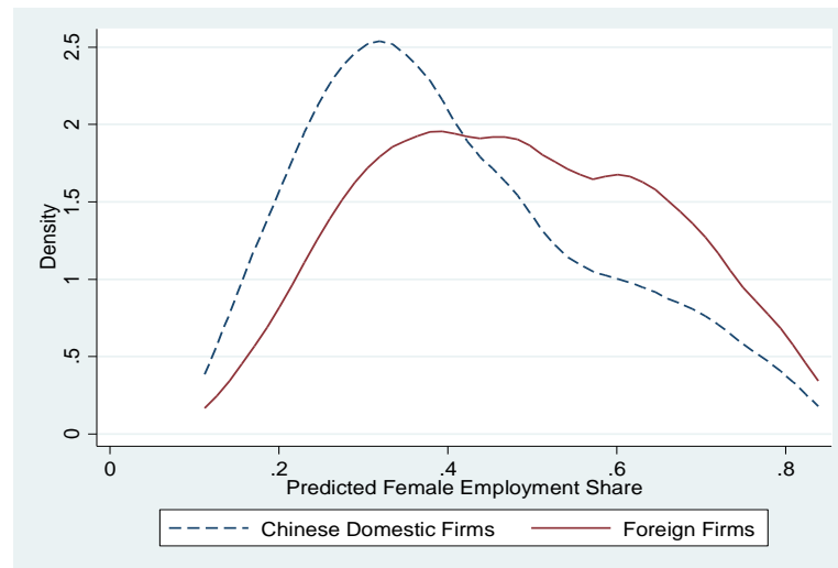
Figure 2: Distribution of Firms' Female Labor Share (2004) (controlling for 4-digit Industry Fixed Effects)