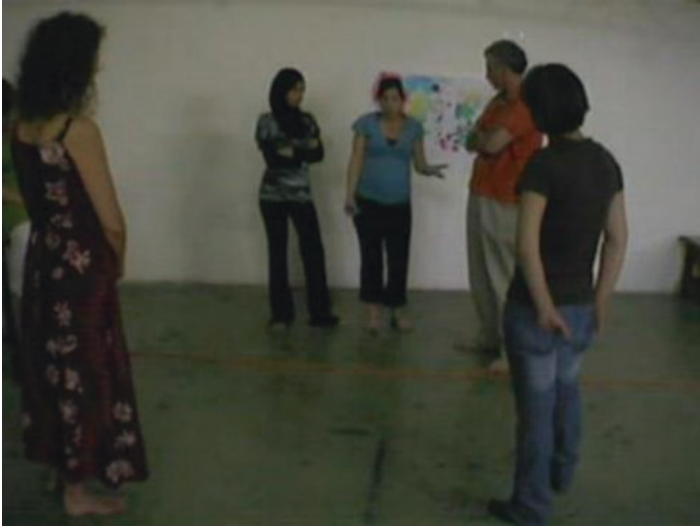
Fig. 13.8 Rehearsal configuration, Session 2 of the action experiment in the Studio for Social Creativity (Photograph by the authors)

studio into an exhibition space, displaying their work as artists usually do. In this configuration the participants not only moved to a different part of the studio and used wall space for the first time, they behaved differently from all previous constellations by arranging themselves as though they were in a gallery, standing opposite a picture, observing it, and commenting to cospectators.