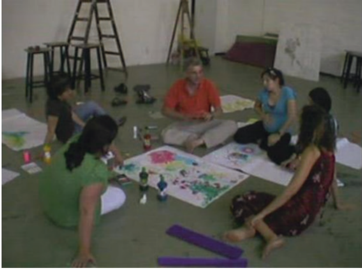
Fig. 13.6 Reflection configuration, Session 2 of the action experiment in the Studio for Social Creativity