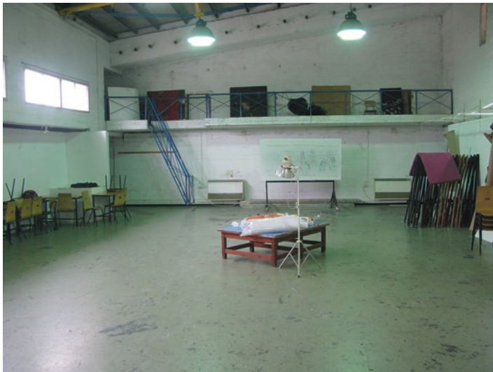
Fig. 13.1 The Studio for Social Creativity, Max Stern Jezreel Valley College, Israel

promoting a process in which people from the region could (a) bring up problems, ideas, and visions, (b) meet others with whom to learn and collaborate on issues of common concern, (c) work together to create innovative, viable projects and enterprises to meet human and economic needs, and (d) create and enact shared visions of regional development that promotes inclusiveness and interdependence rather than competition and divisiveness.