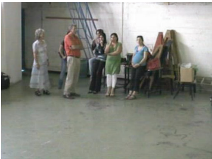
Fig. 13.2 Orientation configuration, Session 2 of the action experiment in the Studio for Social Creativity

The first configuration, Orientation, formed as soon as the participants entered the studio. As visible in Fig. 13.2, the participants bunched closely at the entrance to the studio (the door is invisible just to the left). Three of the participants leaned against a table, one sat on a table, and three stood (the teaching assistant had not yet arrived). At least three of the participants looked outwards into the studio space, getting a sense of the room itself. A few minutes into this configuration the video showed that the participants turned toward each other, talking, listening, gesturing, and looking at a document. 4