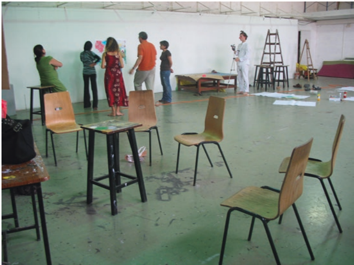
Fig. 13.7 Exhibition configuration, Session 2 of the action experiment in the Studio for Social Creativity