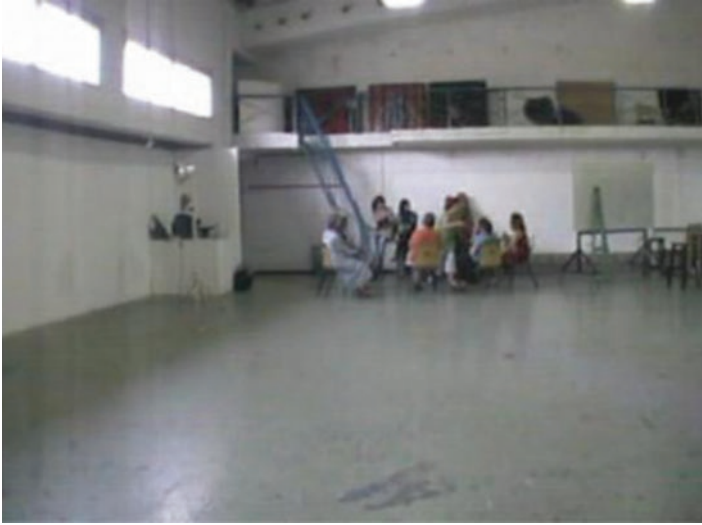
Fig. 13.3 Meeting-mode configuration, Session 2 of the action experiment in the Studio for Social Creativity

The new physical arrangement signaled to the participants that they were in a meeting, hence our choice of the name Meeting Mode for this configuration. The participants looked more comfortable with the situation, into which they could bring the known rules of behavior for meetings. More of the participants spoke during this configuration than during the Orientation.