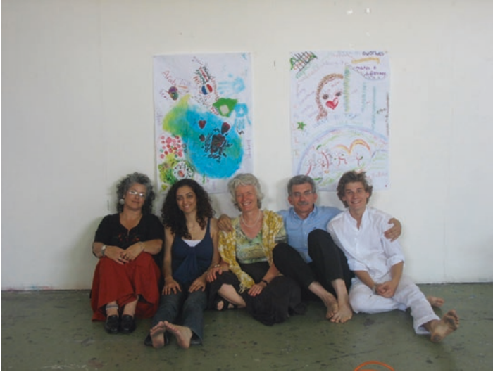
Fig. 13.9 Exhibition configuration, Session 3 of the action experiment in the Studio for Social Creativity