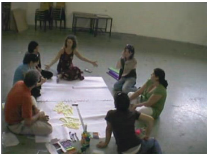
Fig. 13.4 Expansion configuration, Session 2 of the action experiment in the Studio for Social Creativity

and began picking up sheets of flipchart paper, spreading them on the floor in the middle of the room. Some of the participants began to look at, pick up, inspect, and handle the materials. The artist sat down on the floor, followed by researcher 1, the lecturer, and then the students and the teaching assistant. Researcher 2 carried colors, paints, clay, and other materials from the platform to various points near the group.