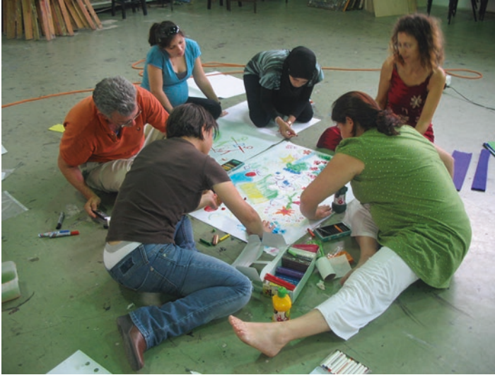
Fig. 13.5 Creation configuration, Session 2 of the action experiment in the Studio for Social Creativity

There was a sudden transition to a new configuration in which the participants began drawing or painting on two shared sheets of paper. Everyone was leaning forward, and there was an appearance of great intensity. We term this configuration Creation (see Fig. 13.5) because a relatively cohesive group took shape and created a collective work. 5 During this Configuration the group appeared to be comfortable behaving as artists, each individual concentrating on aesthetic expression.