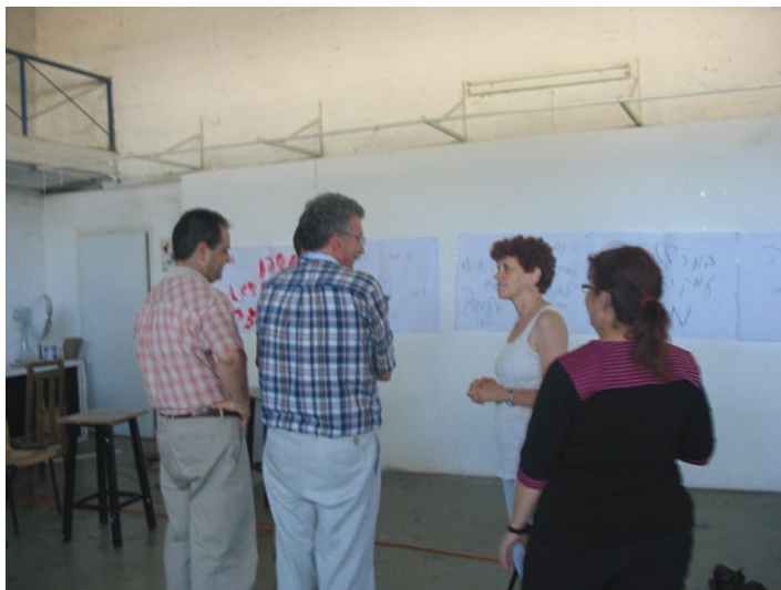
Fig. 13.10 Exhibition configuration, Session 4 of the action experiment in the Studio for Social Creativity

if displayed on walls of the college. The audio material captured a heated discussion about this scenario, revealing possible responses from students and the administration. During Rehearsal in Session 2, the participants set out the rules of behavior for themselves and the 60 nursing students, whereas Rehearsal in Session 4 involved the participants' self-projection into conditions where the rules of behavior were not under their control. In the end they decided not to pursue the idea of taking their work out of the studio.