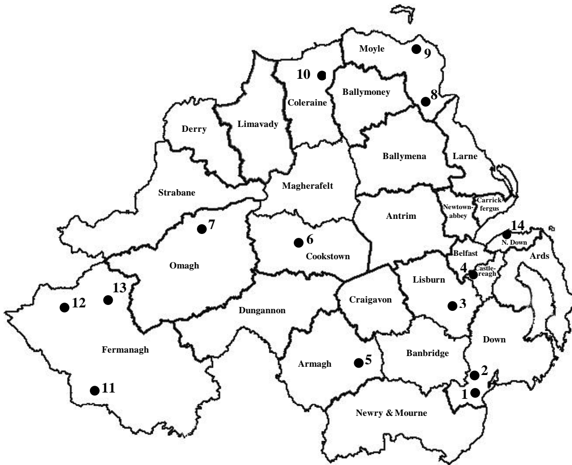
Figure 2. Forest parks and administrative districts in Northern Ireland.