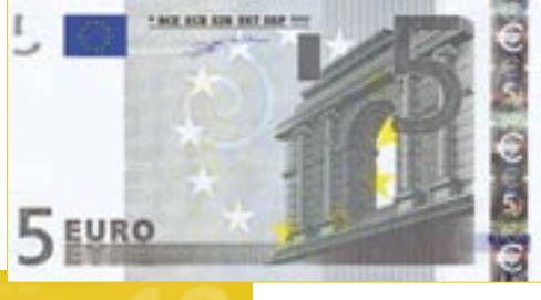
In 2006 all ECB publications will feature a motif taken from the €5 banknote.

This paper can be downloaded without charge from http://www.ecb.int or from the Social Science Research Network electronic library at http://ssrn.com/abstract_id=886048.