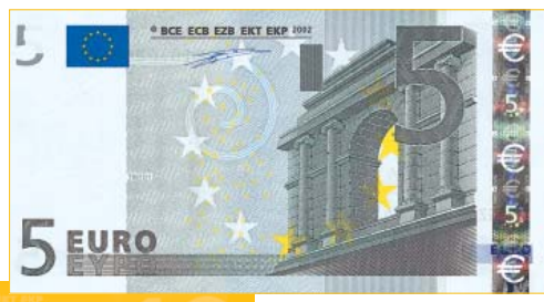
In 2006 all ECB publications will feature a motif taken from the €5 banknote.

This paper can be downloaded without charge from http://www.ecb.int or from the Social Science Research Network electronic library at http://ssrn.com/abstract_id=886047.