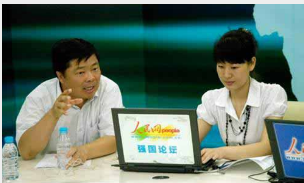
Picture 1 Director General OUYANG Weimin during an online chat on bank cards, 2 July 2009