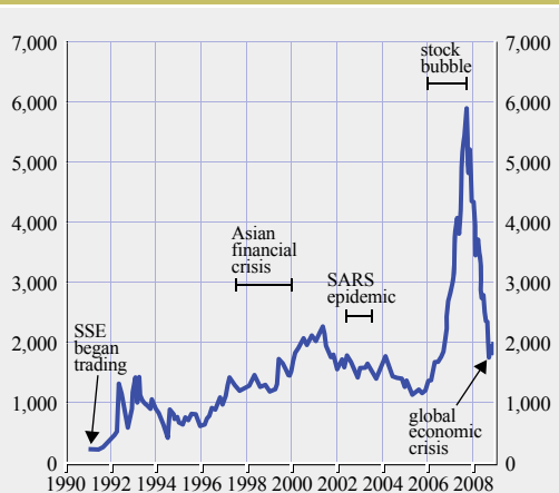
Chart 1 Shanghai (SSE) Composite Index from 1991 to the start of 2009