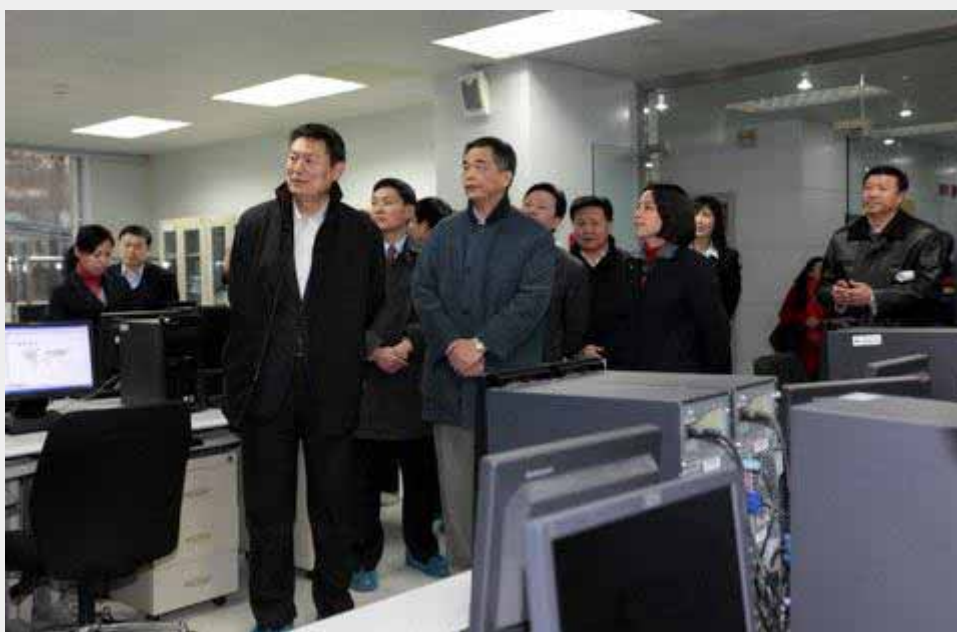
Picture 2 PBC Deputy Governor SU Ning visiting the CNCC on 31 December 2009