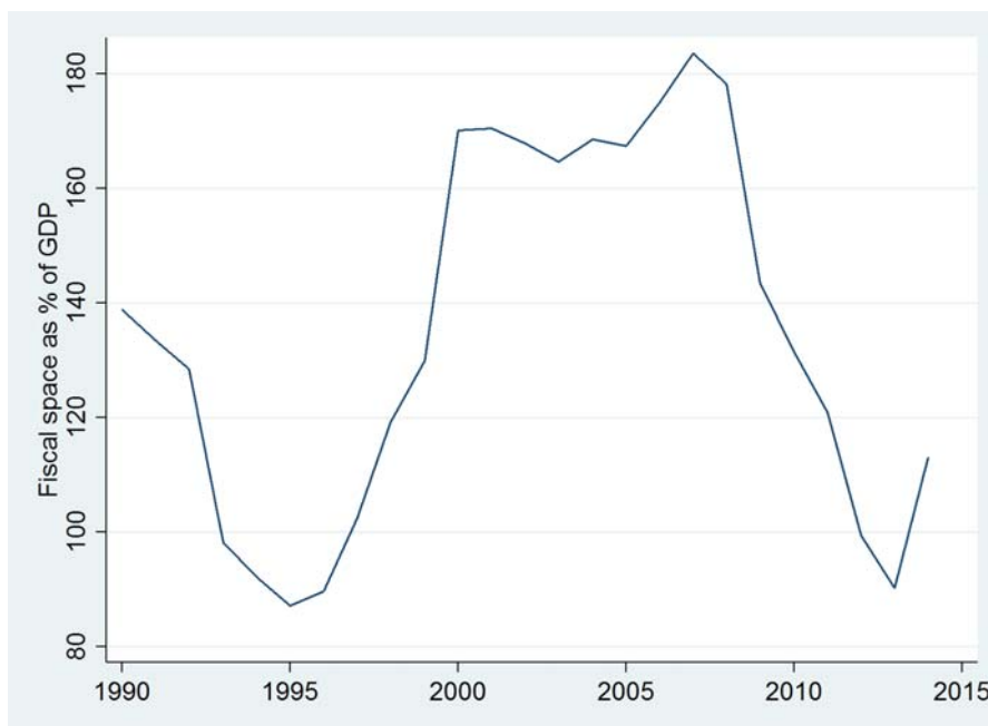
Figure 1: Average fiscal space (as % of GDP) for EU27 from 1990 to 2014 (country composition per year changes due to data availability, see Figure 3 in Appendix A.3)

Estonia, Luxembourg, Malta, the Netherlands, Sweden and Slovakia, the fiscal space remained relatively stable at a high level throughout the full period, possibly also reflecting the fact that these countries were less affected by the sovereign debt crisis.