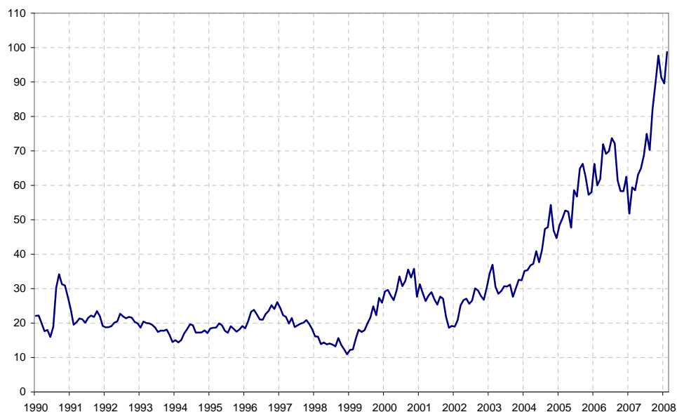
Figure 1: Oil price

Notes: US dollars per barrel, West Texas Intermediate (WTI) grade. Monthly observations. Each observation is the simple average daily spot prices during the third week of the month.