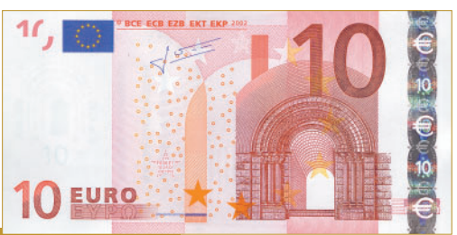
In 2008 all ECB publications feature a motif taken from the €10 banknote.

by Michele Ca' Zorzi<sup>2</sup> and Michał Rubaszek<sup>3</sup>