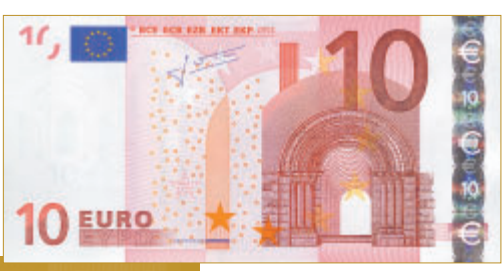
In 2008 all ECB publications feature a motif taken from the €10 banknote.

This paper can be downloaded without charge from http://www.ecb.europa.eu or from the Social Science Research Network electronic library at http://ssrn.com/abstract_id=1090279.