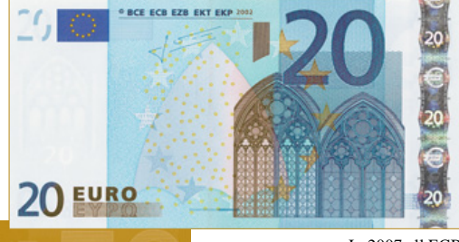
In 2007 all ECB publications feature a motif taken from the €20 banknote.

This paper can be downloaded without charge from http://www.ecb.europa.eu or from the Social Science Research Network electronic library at http://ssrn.com/abstract_id=1030208.