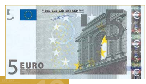
In 2006 all ECB publications feature a motif taken from the €5 banknote.