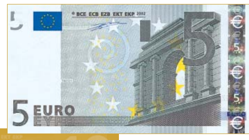
In 2006 all ECB publications will feature a motif taken from the €5 banknote.