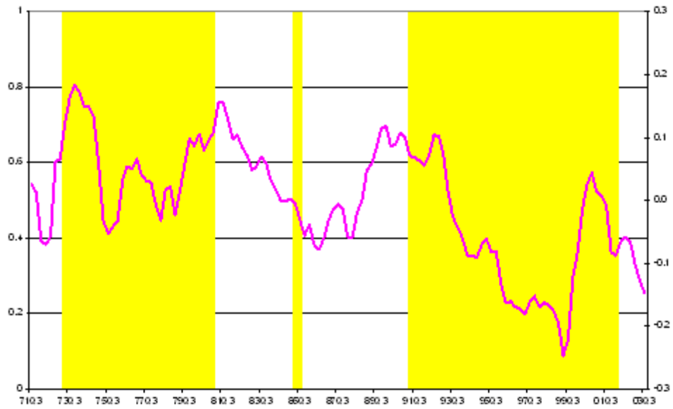
Figure 1: Money demand error-correction term and the regime switching