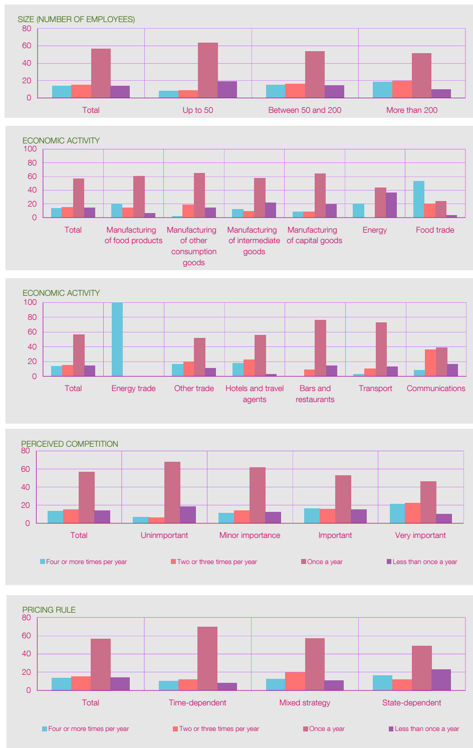
Figure 4 - Frequency of price changes (Question B7) How often do you usually change the price of your product?

whether their prices differ depending on the amount sold, are decided on a case-by-case basis or differ depending on other criteria.