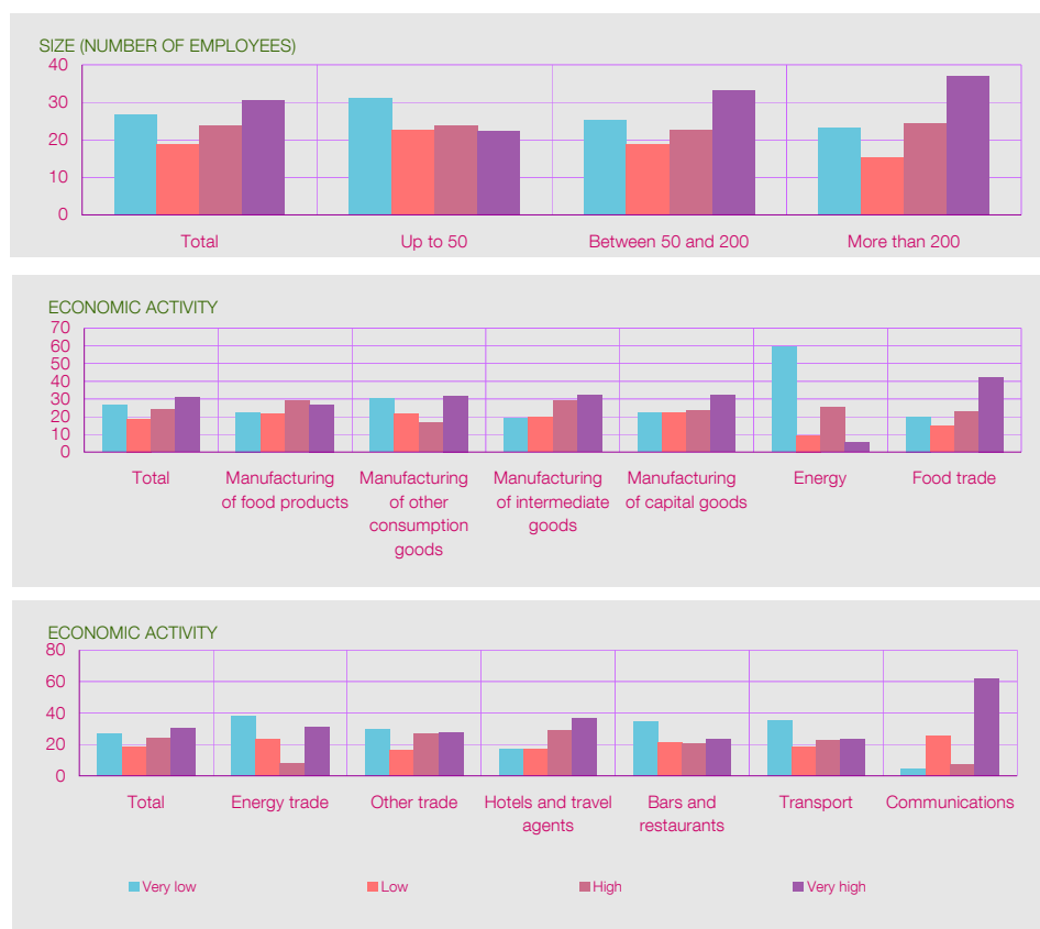
Figure 1 - Degree of perceived competition (Question C2_8) Importance of changes in competitors' price to explain price decreases

The questionnaire included two questions directly related to the degree of competition faced by the firm. Specifically, firms were asked to report on their market share (question A6) and the number of competitors (question A7). Obviously, these two measures have important shortcomings. First, both measures are highly subjective in the sense that, when asked on these two issues, companies may use different criteria to define the relevant market or to identify what is a potential competitor. Second, in some oligopolistic markets with a small number of big companies (with very large market shares), there might be a very