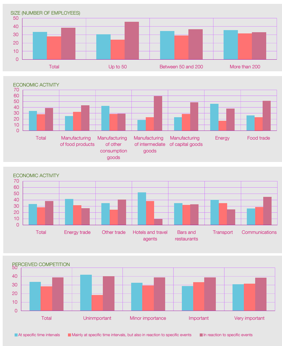
Figure 2 - Time-dependent versus state-dependent pricing rules (Question B4) When do you review the price of your main product?

has considered two alternative types of price setting behaviour: time-dependent pricing rules and state-dependent pricing rules. Under time-dependent pricing rules, companies review their prices at specific dates. The time interval between price revisions may be deterministic 15 , as in Taylor (1980), or stochastic, as in Calvo (1983), although it does not depend on the state of the economy. These models allow for the realistic fact of discontinuous price adjustment, although they assume that companies are unable to adjust to any shock between pre-adjustment dates. Conversely, under state-dependent pricing rules, a firm will change its price whenever there is a large enough shock. An obvious justification for this individual behaviour is the existence of a fixed cost of changing prices as in Sheshinski and Weiss (1977).