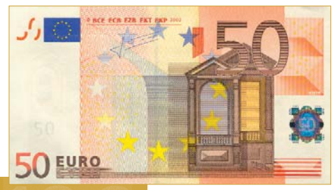
In 2005 all ECB publications will feature a motif taken from the €50 banknote.