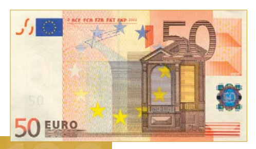
In 2005 all ECB publications will feature a motif taken from the €50 banknote.