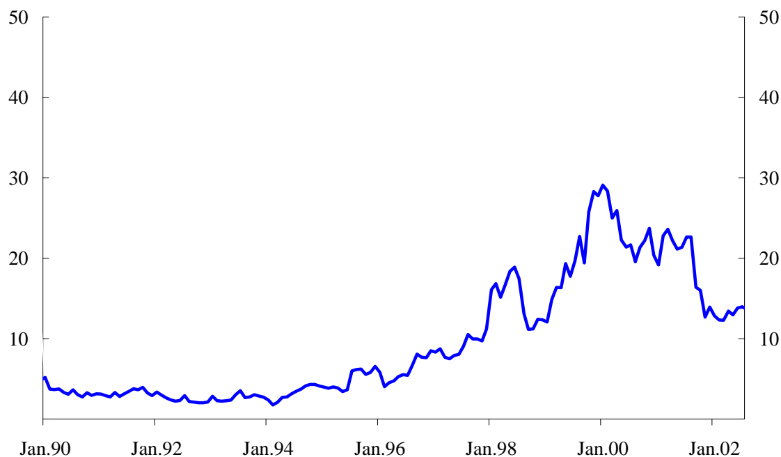
Chart 1 Mergers and acquisitions in the European Union banking sector (EUR billions, 6 months moving averages)

Spearheaded by the creation of the single market for financial services and, more recently, by the introduction of the euro, an unprecedented process of financial consolidation has taken place in the European Union. During the late 1990s, the volume and number of mergers and acquisitions (M&As) increased in parallel with the introduction of Monetary Union (Chart 1). According to most bankers and academics, however, the process of banking integration seems far from completed and is expected to continue reshaping the European financial landscape in the years to come. 1 First, many of the forces underpinning this consolidation process – such as the effect of technological change and financial globalisation – will continue to exist. Second, the number of banks per 1,000 inhabitants in the European Union is almost double the number in the United States, suggesting that there is room for consolidation in the European Union. Third, there is still a considerable degree of heterogeneity across European Union countries in terms of the concentration of banks.