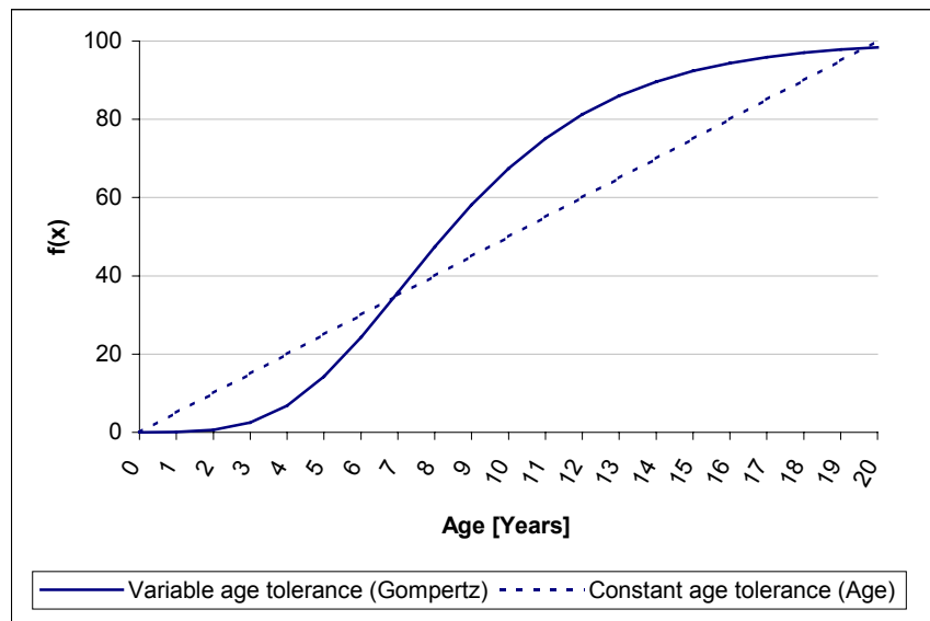
Figure 2: The Transformed Age Function

According to these assumptions, the relationship between age and credit worthiness/access to financial resources may be described by a s-shaped pattern, as illustrated in figure 2. Modelling is done by means of the following Gompertz-type function,