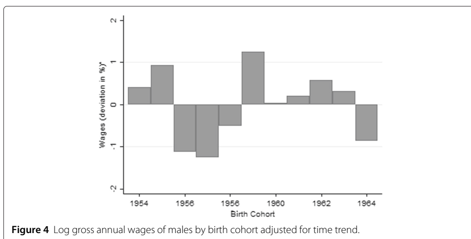
Figure 4 Log gross annual wages of males by birth cohort adjusted for time trend.

the adjacent three years. This implies that the system of military conscription causes a reduction of university education completion from 12.3 to 10.8 per cent. If there had not been a system of military conscription, the proportion of male university graduates in the adjacent three cohorts before and after 1959 would have been 1.5 percentage points higher. This reduction probably induces substantial societal costs as tertiary education is often considered to be important for social welfare and economic growth (Hanushek and Woessmann 2008). The IV-estimates are obtained through a rescaling of the reduced form estimates with the proportion of conscripts per birth cohort. These estimates suggest that the impact for the compliers, those that would serve if they were not born in