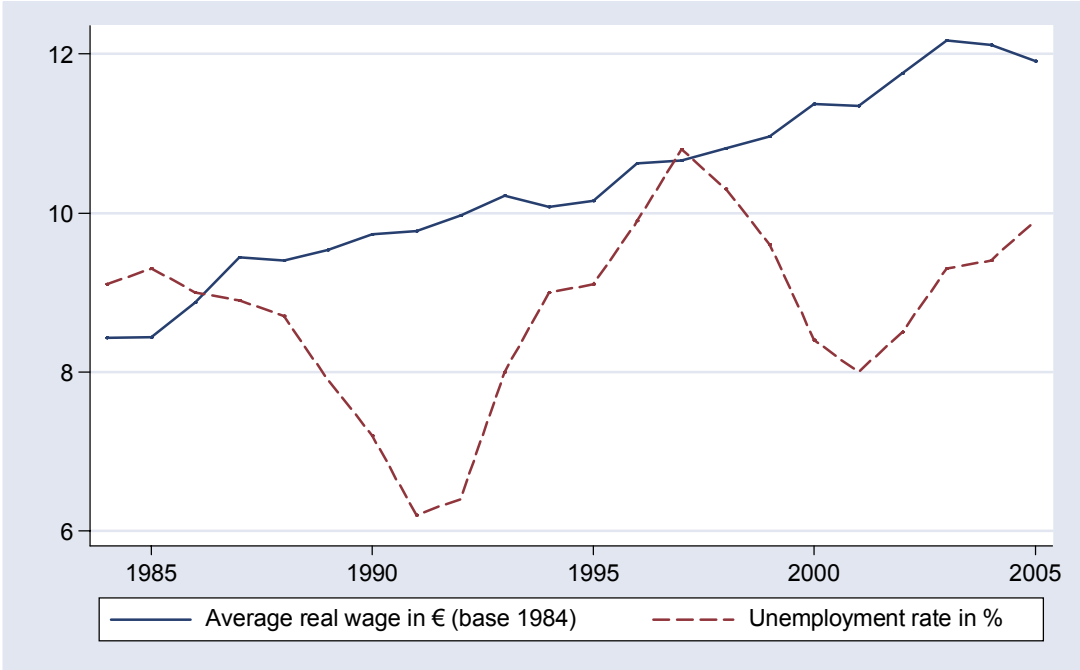
Figure 2: Real Wage and Unemployment Rate (West Germany)