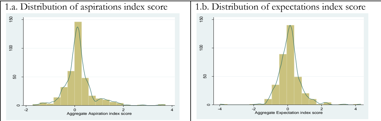
Fig. 1. Distribution of aspirations and expectations indices

and expectations by comparing their scores to the district average. Table 4 indicates that about 33% and 41% of household heads had low aspirations and low expectations, respectively. Female household heads were also more likely than their male counterparts to have low aspirations and expectations. Further, wealthier and more highly educated individuals were less likely to have low aspirations and low expectations. Surprisingly, a higher percentage of household heads in the younger age groups showed low aspirations and low expectations. Perhaps, this could be because of their limited experience and information set and hence narrow aspirations window.