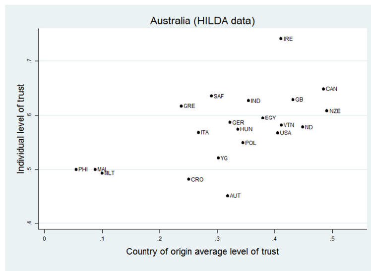
Sample: second generation immigrants residing in Australia