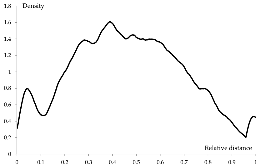
Figure 1: Probability distribution function of the relative distance for new constructions, French urban areas 2006-2012

Notes: All years of data used. 218,657 observations. For each new construction, we compute the distance between the centroid of its municipality and the centroid of its urban area and divide by the greatest observed distance for any new construction in this urban area.