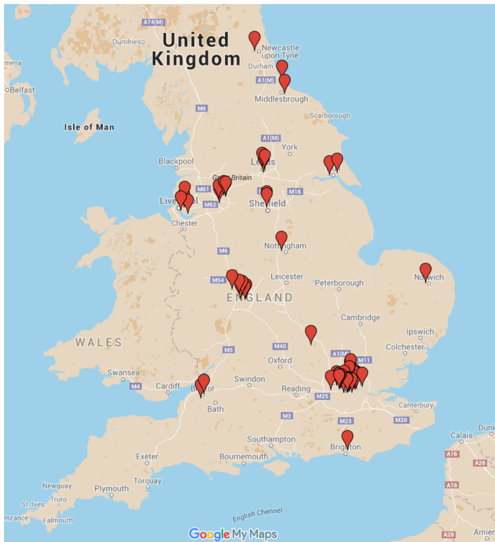
Figure 1: Location of experimental schools across England