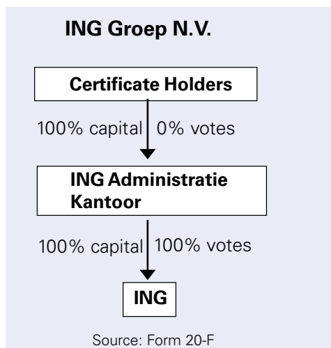
Source: Form 20-F