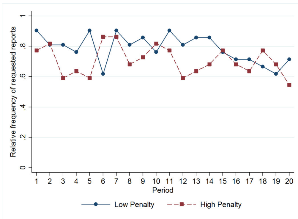
Figure 2: Relative frequency of requested reports