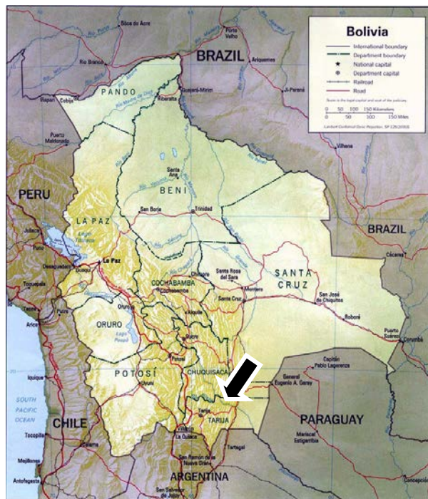
Figure 1: Map of Bolivia

usually based on the notion that agricultural production is the basis for livelihood, and that it is indispensable for survival and development. This notion is not only embraced by the rural population, but is also central to official discourses and programmes. It is even embodied in constitutional law, for example, where it stipulates that the state will work towards the creation of agricultural insurance (Article 406). The national MAS government, which relies on peasants as an important voter group, has created various mechanisms in order to improve its support for agricultural production. Law 144 of 2011, which among other instruments created the national agricultural insurance (“Seguro Agrario Universal Pachamama”) is an example for this approach. In Bolivia, agricultural insurance is expected to fulfill development purposes and disaster relief functions (Hazell et al. 2010) at the same time.