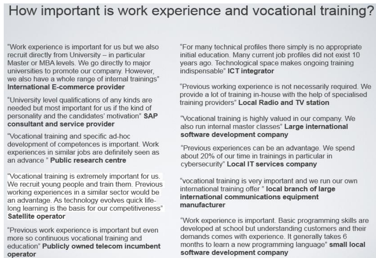
FIGURE 4 - WORK EXPERIENCE, VOCATIONAL AND FORMAL EDUCATION

school or university as very often it is difficult or impossible to attract experienced people. Many interviewees reported that they recruited junior staff and that substantial investment were made into the continuous vocational education and training of these junior recruits. The difficult then resides in keeping these people on board due to the high competition between employers. Some also mentioned issues related to experienced people leaving companies for sometimes better paid and more secure jobs within the public sector. Figure 4 presents the details of some comments collected about working experience and vocational training.