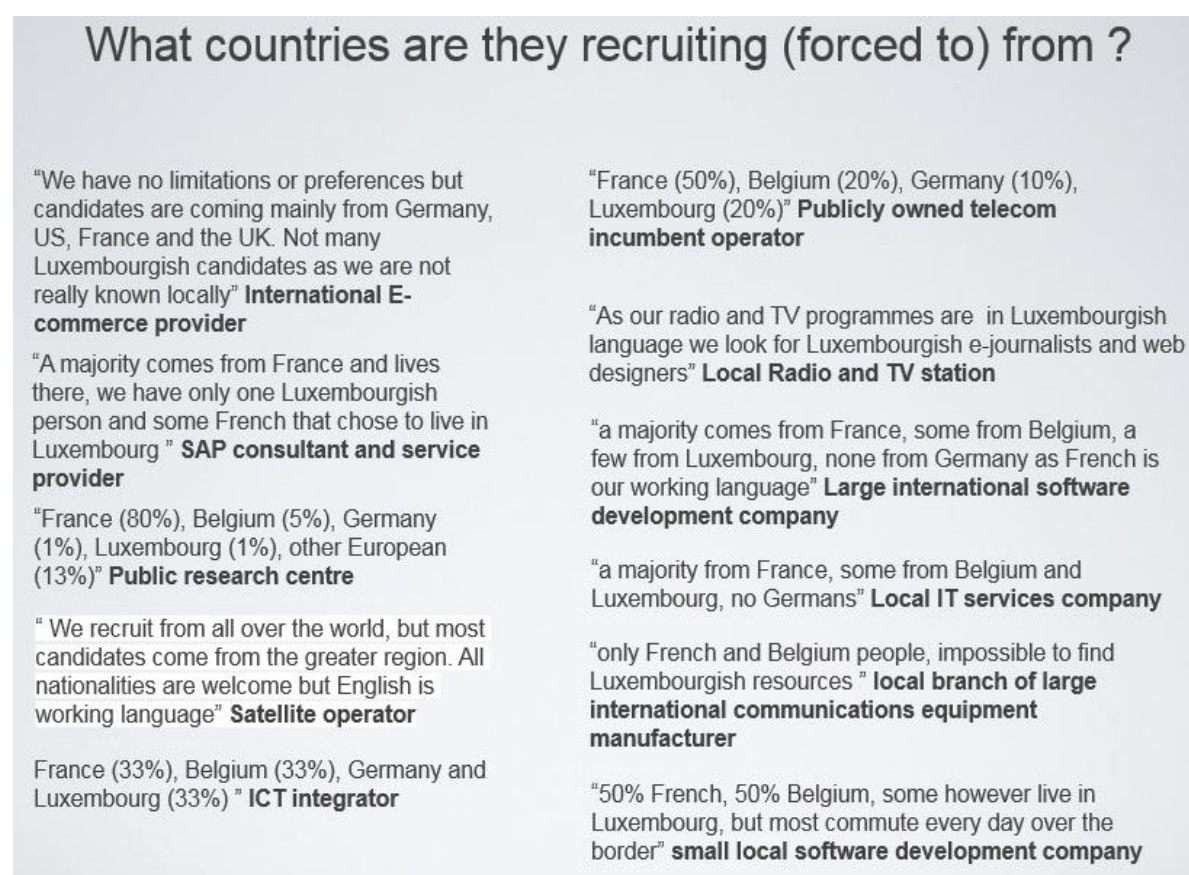
FIGURE 3 - AN INTERNATIONAL WORKFORCE

In terms of nationalities, a lot of the existing workforce appears to be of French or Belgium extraction and these employees tend to reside in their respective home countries and commute to Luxembourg on a daily basis. Figure 3 (below) presents an overview of some of the comment made regarding this issue by interviewees. It confirms some of the difficulties that employers face when trying to recruit the necessary job profiles. Apparently, the country is not able to produce its ICT professionals locally.