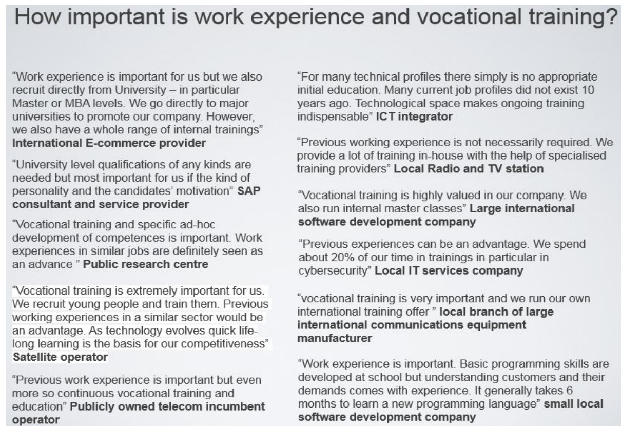
FIGURE 4 - WORK EXPERIENCE, VOCATIONAL AND FORMAL EDUCATION

school or university as very often it is difficult or impossible to attract experienced people. Many interviewees reported that they recruited junior staff and that substantial investment were made into the continuous vocational education and training of these junior recruits. The difficult then resides in keeping these people on board due to the high competition between employers. Some also mentioned issues related to experienced people leaving companies for sometimes better paid and more secure jobs within the public sector. Figure 4 presents the details of some comments collected about working experience and vocational training.