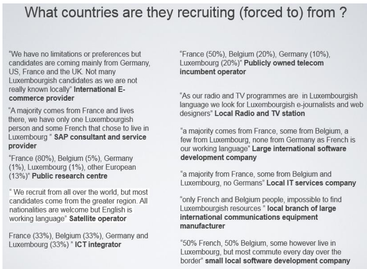
FIGURE 3 - AN INTERNATIONAL WORKFORCE

In terms of nationalities, a lot of the existing workforce appears to be of French or Belgium extraction and these employees tend to reside in their respective home countries and commute to Luxembourg on a daily basis. Figure 3 (below) presents an overview of some of the comment made regarding this issue by interviewees. It confirms some of the difficulties that employers face when trying to recruit the necessary job profiles. Apparently, the country is not able to produce its ICT professionals locally.