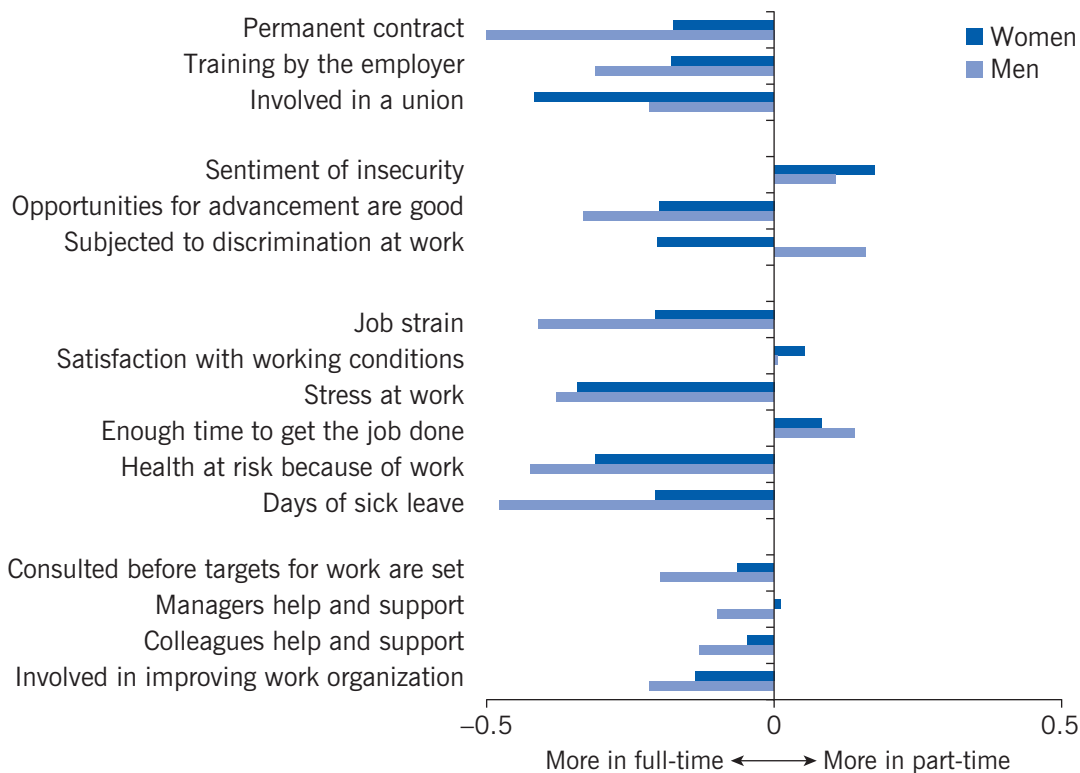
Figure 2. Assessment of non-monetary aspects of part-time work relative to full-time work, 2010

Note: Values can vary between -1 and 1. A value above zero signals a higher incidence among part-time workers, while a value below zero signals a higher incidence among full-time workers.