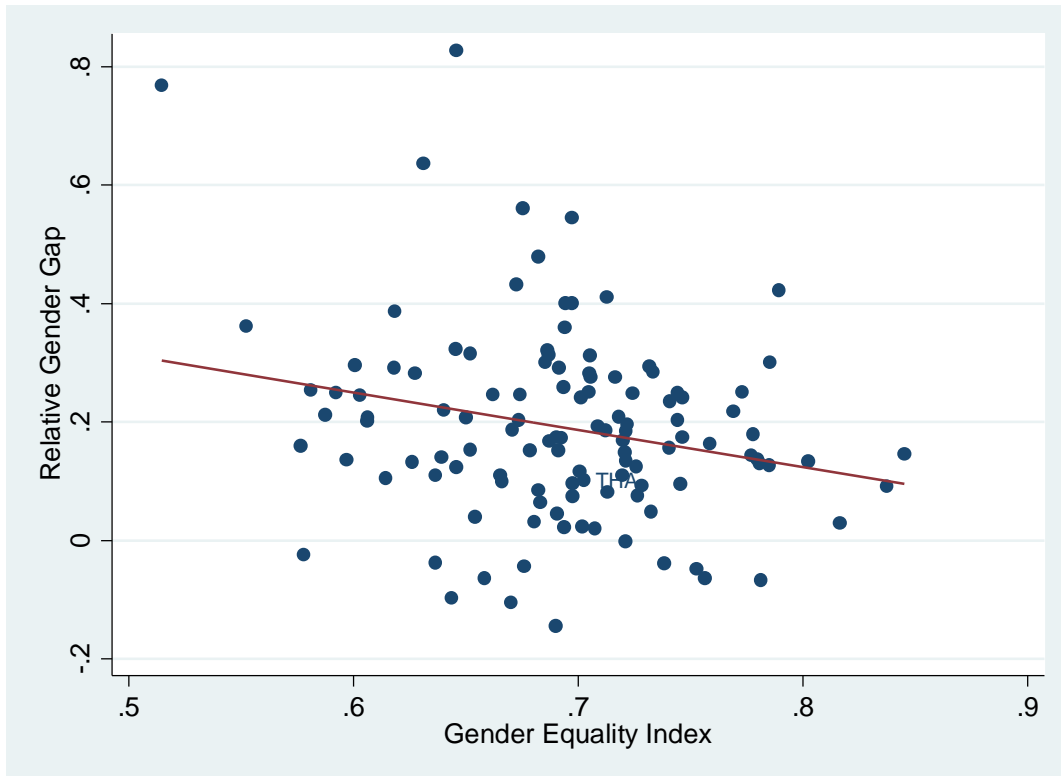
Figure 2: Relative Financial Literacy Gender Gap and Gender Equality Index

Notes: The graph plots the relationship between the relative financial literacy gender gap, calculated as the proportion of financially literate men minus the proportion of financially literate women divided by proportion of all financially literate people in that country, and the gender equality index as published by the World Economic Forum in 2013. The ordinate is Relative Financial Literacy Gender Gap. This relationship is statistically significant at 5%.